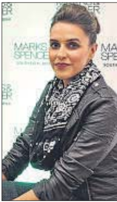
■ Neha Dhupia at the opening of a new M&S store.