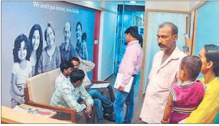
■ A free health screening camp was held at Sohna Road by Nationwide - The Family Doctors.