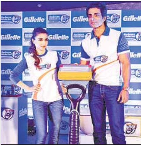
■ Soha and Sonu Sood at the launch of a new Gillette product.