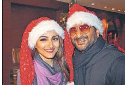
■ Soha Ali Khan and Arshad Warsi came to promote their new film.