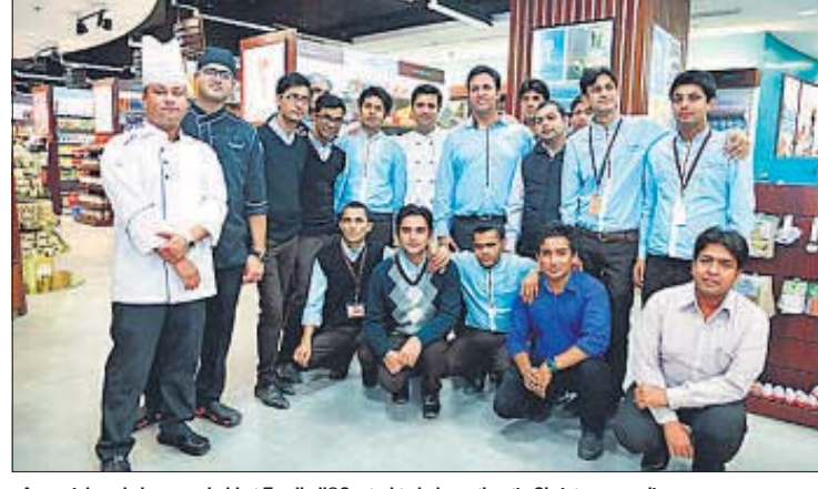
■ A special workshop was held at Foodhall@Central to bake authentic Christmas goodies.