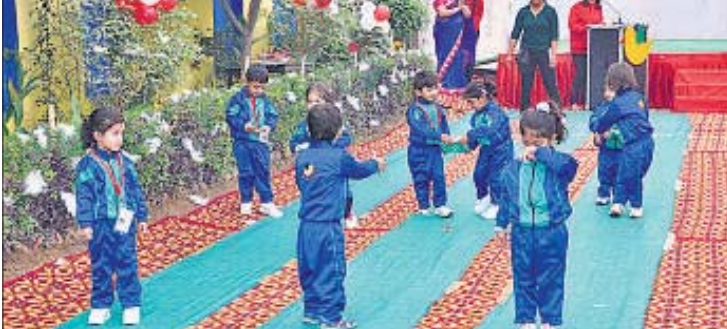
■ Students of Kinder Plume taking part in the activities during a Christmas carnival at their school.

A street-culture movement initiated by adidas, called Adidas Originals Collision was organised at the Garden of Five