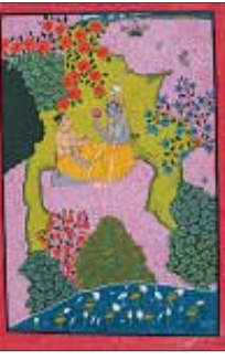
Miniatures of Rama are on view at National Museum.

Event: Rama-Katha The story of Rama through Indian miniatures Date: Up to October 13 Venue: Special Exhibition Gallery, National Museum, Janpath