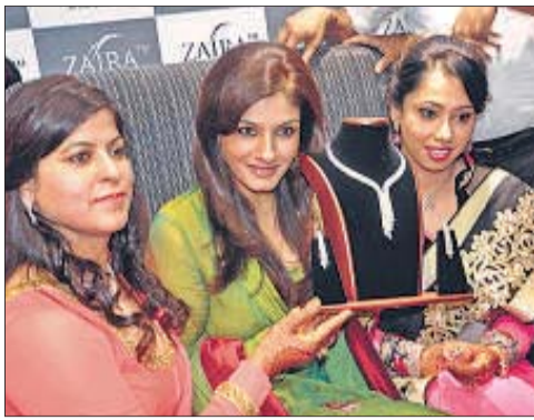
Raveena Tandon at the inauguration of a retail outlet of a UK based jewellery firm in Preet Vihar.