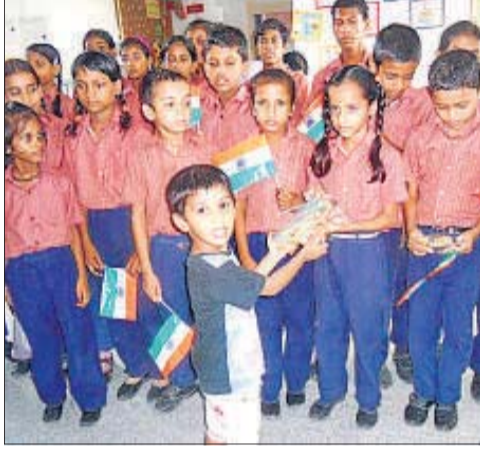
Children from Anand Vidyalaya interacting with those from Kinder Plume School during the Independence Day celebrations.