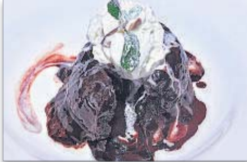
Mouth watering chocolate pudding (above) and meat pizza (below).