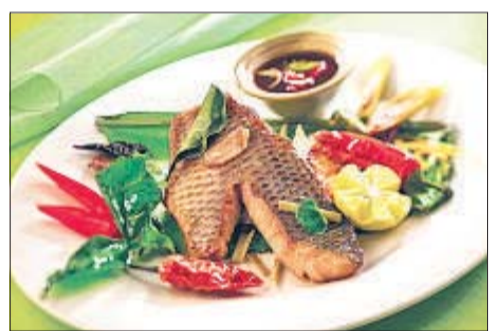
• Grilled fish fillets are a must try at Neung Roi.