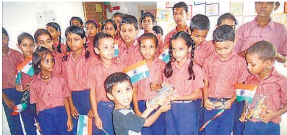
• Children from Anand Vidyalaya interacted with those from Kinder Plume during the Independence Day celebrations.