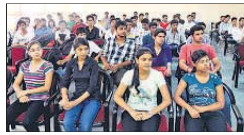
• DPGITM Engineering College, Gurgaon, organised a one day seminar on international youth day at its campus.