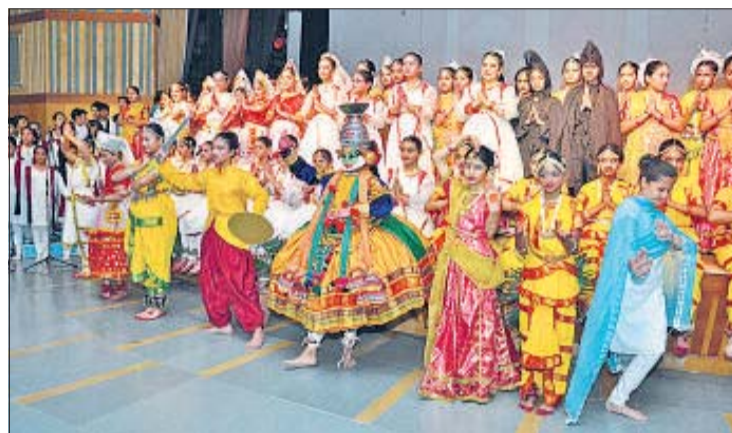
• The scholar badge ceremony of Delhi Public School, Sector 45, was a colourful affair.

To sensitise the students about various issues of global concern, a DAV Model United Nations Conference was organised in collaboration with United Nation's Information Centre for India and Bhutan at DAV Public School, Sector 14, Gurgaon. More than 200 students donned the mantle of delegates representing 100 member countries of the UN, debating, deliberating and discussing issues within the confines of protocol and diplomacy. The four committees, vis-a-vis General Assembly, Human Rights Council, Security Council and the United Nation's Development Programme took up agendas like private military contractors, protection of the right to information with regard to the Internet and information technologies, the situation in the South China Sea, civil war and post conflict reconstruction and development. The global press reported the discussions and the resolutions