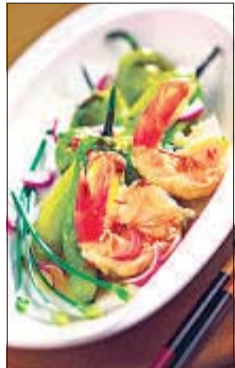
• The restaurant has food from four regions of Thailand.

From Isan, grilled mushroom skewers or wok fried tofu are good choices for vegetarians. Grilled fish fillet in banana leaf is a good option for non-vegetarian