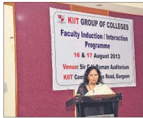
• A two-day induction-cum-interaction programme for teaching and non-teaching staff was organised by KIIT Group of Colleges.

KIIT Group of Colleges, Gurgaon, organised a two-day induction-cum-interaction programme for its teaching