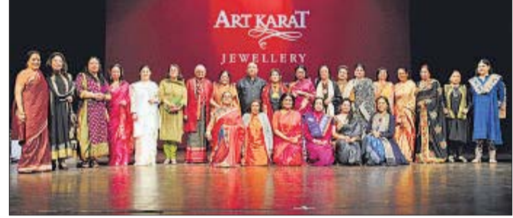
Women achievers from various fields were felicitated at a function organised by Art Karat.