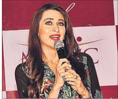
Karisma Kapoor launched a beauty oil at Chattarpur Farms.