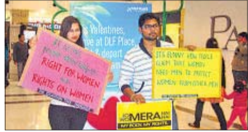
A freeze mob was organised at DLF Place, Saket, to educate people about the safety and respect of women.

St Stephen's College organised a session on the crisis in the Eurozone - a view from Poland. The former prime minister of Poland and the current chief of Poland