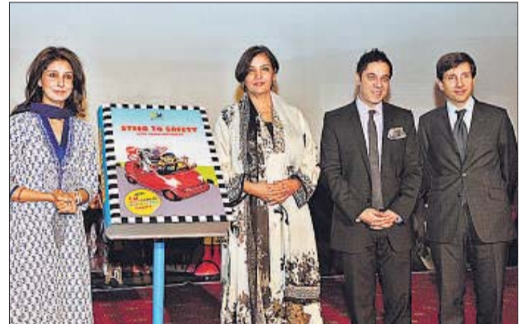
Shabana Azmi was the chief guest at a function to conclude the road safety campaign of PVR Nest.