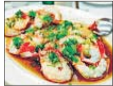
Enjoy a brunch at Dimsum Bros, New Friends Colony.

Event: Get Juiced With mocktails Venue: All outlets of Berco's Event: Share Your Fish Tales Date: Up to March 15 Venue: Blanco, Khan Market Event: Sunday Brunch Date: Up to March 24 Venue: Dimsum Bros, K-185/1, Surya Plaza Complex, New Friends Colony Event: Ladies Night Every Wednesday Venue: Cooper's Grill & Bar, Shop No 33, 34 & 35, ground floor, DLF Star Tower, National Highway 8, Sector 30, Gurgaon Event: Scotch Fest Swirl, smell and sip the time-honoured selection of Scotch Date: Up to February 28 Time: 5pm onwards Venue: Bar Zen, Courtyard by Marriott Gurgaon Event: Healthy Start Have a breakfast party Venue: The Pink Room 29A, Hauz Khas Village Event: You See Three We See Two Complimentary meal for one per-