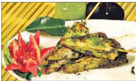
The food offered at Soi Thai retains its freshness and flavours because everything is prepared inhouse.

While the flavours of Thai delicacies are standout and vibrant, Soi Thai's interiors are minimalistic with simple decor and motifs. Large windows, rustic wooden benches and chairs with square tables give the place a very bright and earthy charm. Emerging artists have a free